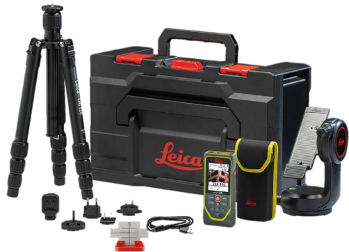
Leica DISTO™ X6 P2P-Package Art. No. 950878

Leica DISTO™ X6 P2P Package, Pouch, Charger with Cable, Hand Loop, DST 360-X Adapter, TRI 120 Tripod, GZM 3 Target Plate, Quick Start Guide, Warranty Card, Safety Manual, Calibration Certificate Silver